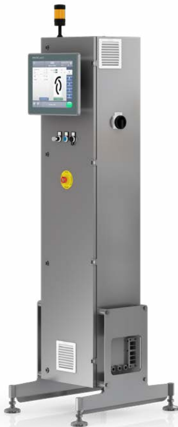
X-ray scanner SC 2000